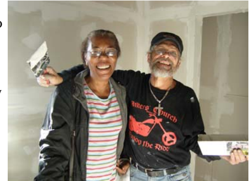
The homeowner with one of the team members

Just recently, our church also hosted a one-week missions team. As a church, we desire to be active in the community for the physical as well as the spiritual rebuilding of this city. On the week of Thanksgiving, fifteen people from a church in Kentucky came down to minister in the city. I led the team through-out the week where we spent most of the days hanging sheetrock in a local resident's house. We also went down to a local mission and helped serve Thanksgiving dinner to about 150 homeless people. It is a joy to partner with believers from all over the country that have a heart for New Orleans and the urban poor. By faith, I see houses being rebuilt in this city until everyone has a place to live and where homelessness becomes a thing of the past.