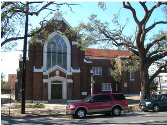
Our new church building!

In many of my past newsletters, I have asked that you pray with me about a permanent building for All Nations Fellowship. I am excited to tell you that our prayers have been answered! Last year, we had made a bid on a vacant church building, but a short while later, these plans fell through. Over this