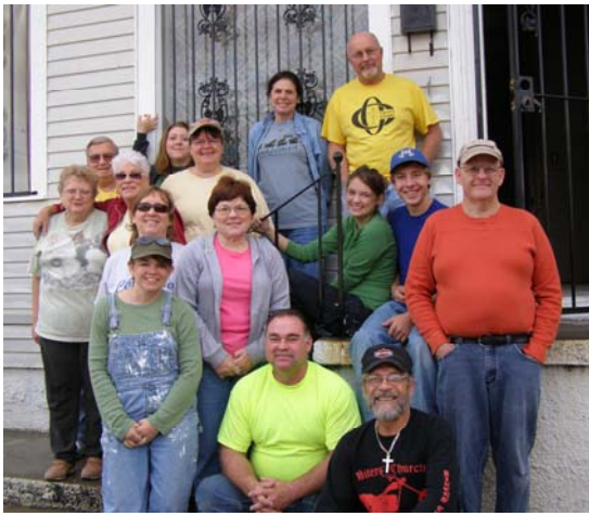
The Kentucky Missions Team in front of the house they worked on

Just recently, our church also hosted a one-week missions team. As a church, we desire to be active in the community for the physical as well as the spiritual rebuilding of this city. On the week of Thanksgiving, fifteen people from a church in Kentucky came down to minister in the city. I led the team through-out the week where we spent most of the days hanging sheetrock in a local resident's house. We also went down to a local mission and helped serve Thanksgiving dinner to about 150 homeless people. It is a joy to partner with believers from all over the country that have a heart for New Orleans and the urban poor. By faith, I see houses being rebuilt in this city until everyone has a place to live and where homelessness becomes a thing of the past.